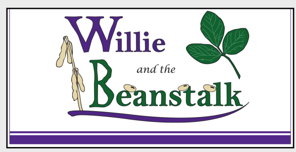
Sponsored by Kansas State University Department of Agronomy

The 2023 Willie and the Beanstalk competition will be held as part of the 2023 Spring Kansas State University Open house.