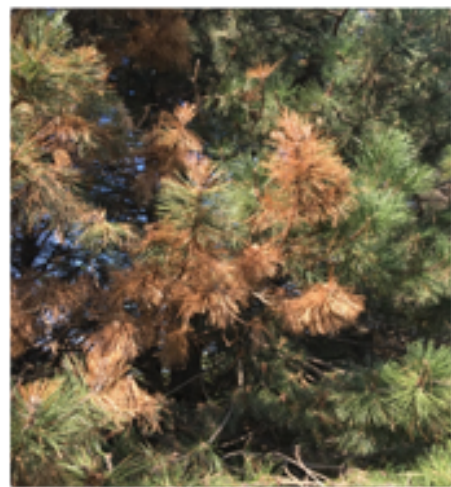
Pine Tip Blight disease identified in Eastern Cowley County.